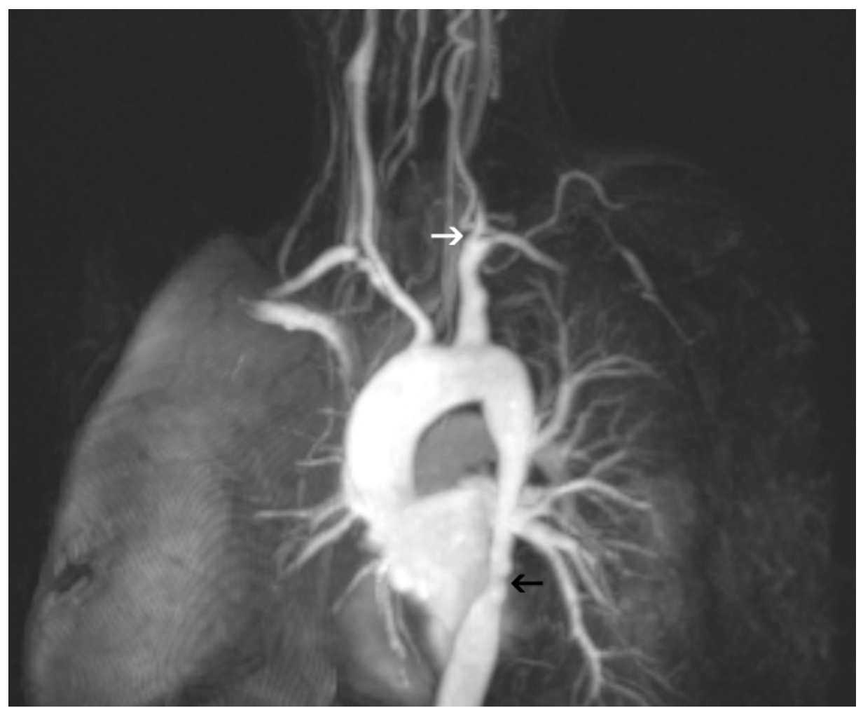
Figure 2. Magnetic resonance angiography showed minimal flow in the left common carotid artery (white arrow) and severe narrowing of the aortic thoracic segment (black arrow).

controlled well with 5 mg amlodipine. Progress in medical technology has made the diagnose of TA easier. Computed tomography and magnetic resonance imaging can help to detect vascular diseases.<sup>9</sup> In our case, MRI angiography was useful in evaluating the arterial involvement in TA. To diagnose TA accurately and as promptly as possible, and to evaluate the disease appropriately, the combined use of various imaging techniques is necessary.