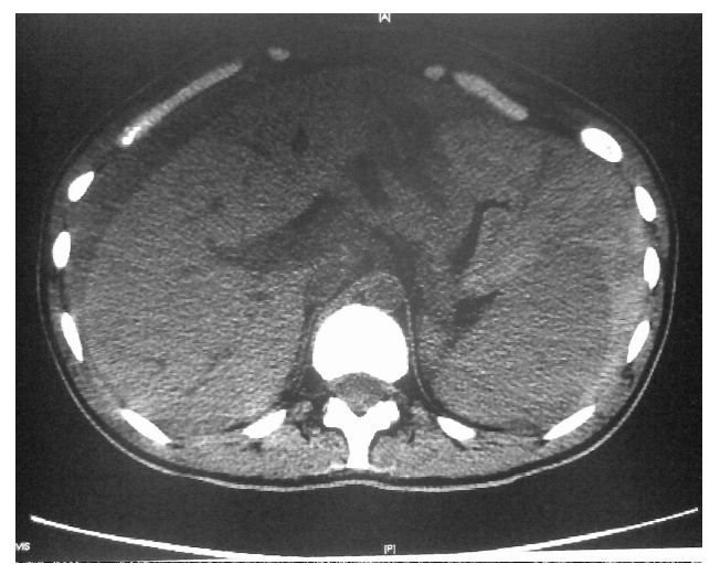
Figure 1. CT scan of the abdomen showing free fluid surrounding the liver.

Two days after admission, abdominal pain increased and became generalized, his blood pressure dropped to 88/44 mm Hg, his pulse was 137 /min and his temperature was 38.8 °C. generalized Abdominal examination showed tenderness, guarding with rebound tenderness. His haemoglobin dropped to 5.8 gm/dl and ultrasound/computerized axial tomographic examination showed significant intra abdominal fluid but failed to localize its source (Figure 1).