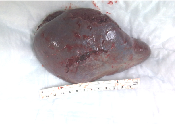
Figure 5. Capsular tear on the diaphragmatic surface of the spleen.

immunity against the parasite during intra uterine life.<sup>2</sup> Their Immunity may wane or disappear if they leave their abode for more than six months. A mortality rate of 1% has been reported in inhabitants of endemic areas due to the parasite, with a much higher rate among incoming travelers who lack the immunity.<sup>1</sup>