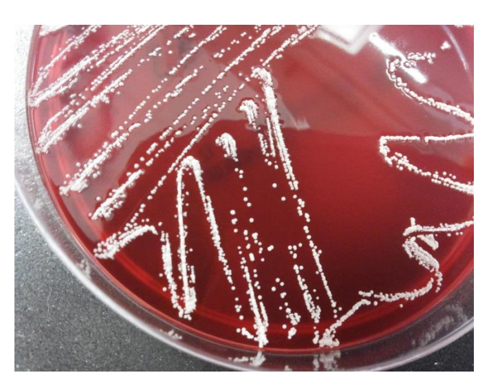
Figure 2. Whitish chalky colonies of N. paucivorans yielded on blood agar.