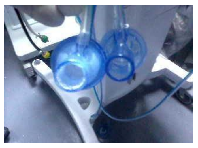
Figure 2. Flow sensors; white crystals noted in the internal part for a patient who received nebulized colistin (left), while the other flow sensor for a patient who did not receive nebulized colistin (right)

ventilator circuit in patients who received NC. The crystals were found as early as two days after initiating NC. In our previous case reports, crystal formation and the change in the ventilator component were observed as early as one day after initiating NC.<sup>9</sup> The aftermath of crystal formation was the requirement for change in at least one of the ventilator components in the majority of subjects receiving NC.