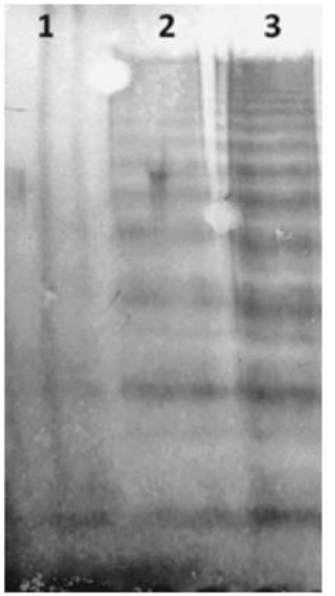
Figure 2. Multimer gel image demonstrated the presence of high molecular weight multimers.

patient. Interestingly, DDAVP was able to stimulate enough secretion of VWF from endothelial Wiebel-Palade bodies to overcome the clearance of VWF by the autoantibody, resulting in normalization of VWF:Ag and VWF:Act levels, and reappearance of HMW multimers. The decrease (but still abnormal) VWFpp:Ag ratio reflects the increased secretion also (5.3)stimulated by DDAVP relative to clearance that remained constant. VWFpp is cleaved in the trans-Golgi but remains stored together with mature VWF in platelet \alpha -granules and endothelial cell Weibel-Palade bodies in equimolar amounts. After release, VWFpp dissociates from the mature VWF subunit, circulates with a steady-state halflife, and serves as a marker of VWF secretion.<sup>10</sup> A high VWF:pp/Ag ratio has been proposed by Scott et al.,<sup>11</sup> as a simple method to distinguish AVWS due to decreased VWF synthesis from that due to increased clearance. Federici et al.<sup>8</sup> characterized in their paper some differences in AVWS caused by IgG-MGUS versus IgM MGUS. Although the paper reported on only 8 IgG-MGUS and 2 IgM MGUS, they reported a higher vWF:pp/Ag compared to controls in IgG MGUS but not in IgM MGUS. In addition, a normal multimeric pattern was seen in the IgG MGUS cases but